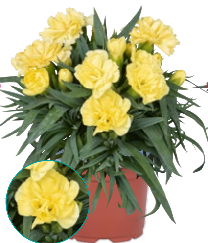
Oriental Honey Moon | 17600