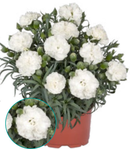
Oriental Durcal | 17585