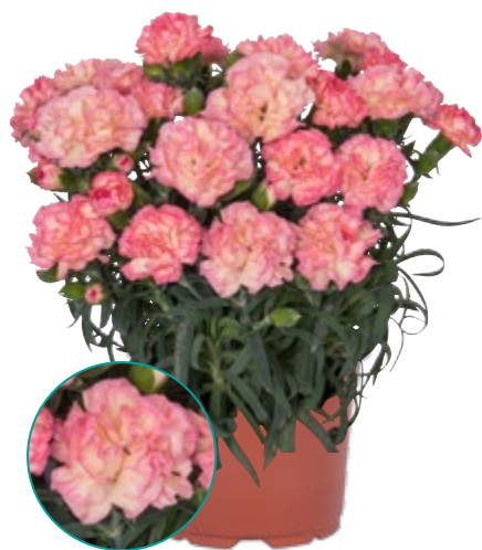
Oriental Floriane | 17572