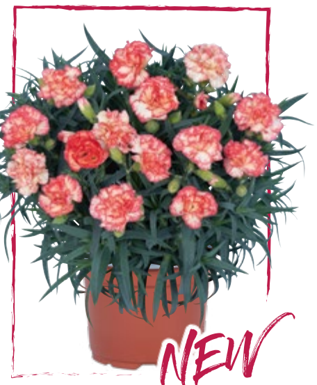
Oriental Tequila | 17749