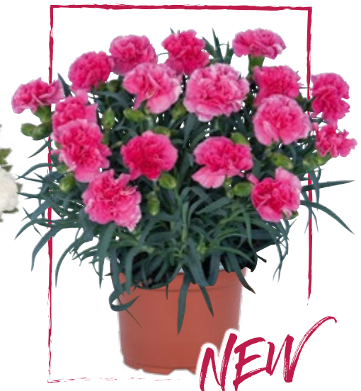
Oriental Pretty Rose | 17958