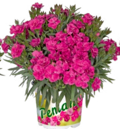
Peman Fancy Cerise | 17546