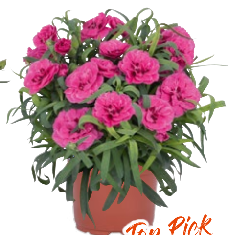
Arabella Purple | 17698