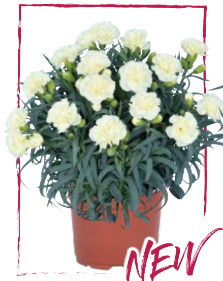
Oriental Lemon Ice | 17916