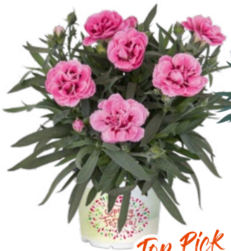
Sprint Pink | 17530