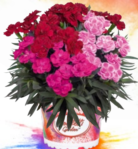
Confetti Garden® Wild Panther | 48327