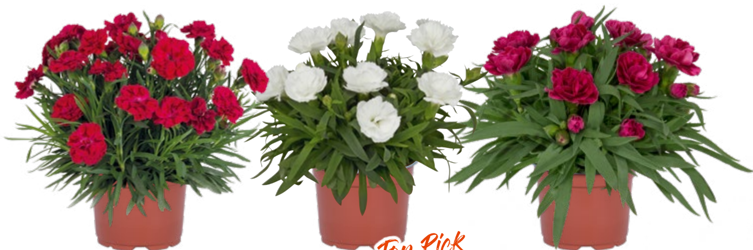
Sprint Bordeaux | 17831