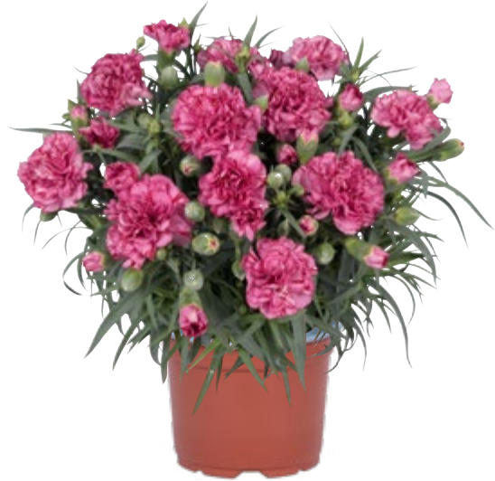
Oriental Purple Bien Fait | 17622