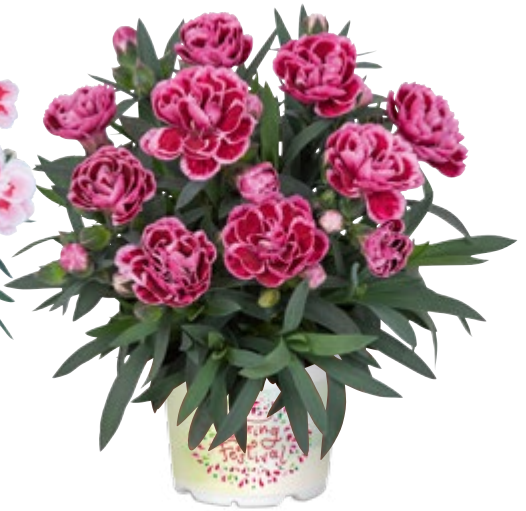
Sprint Burgundy | 17786