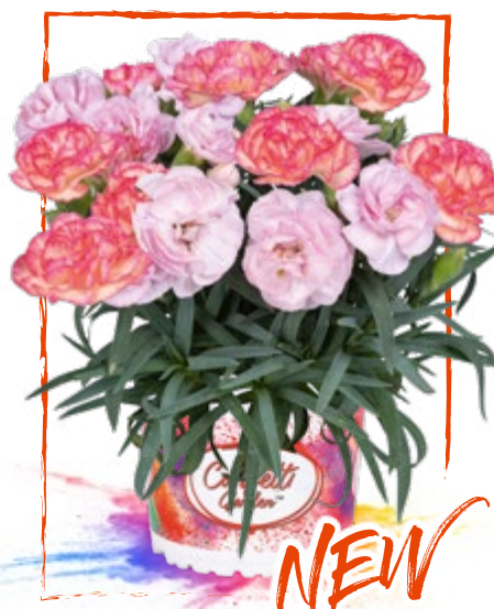
Confetti Garden® Baltic | 48848