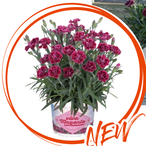
Viva Magenta | 17950