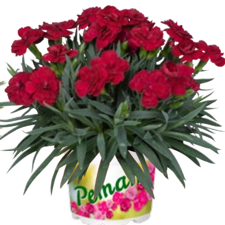
Peman Red | 17782