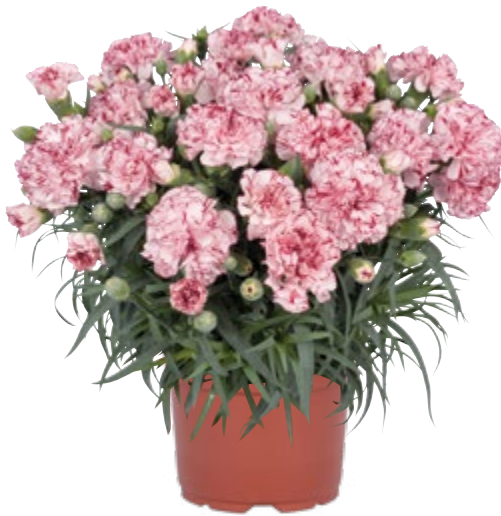
Oriental Bien Fait | 17612