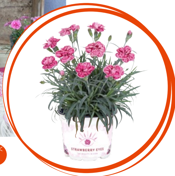
Strawberry Eyes | 17889