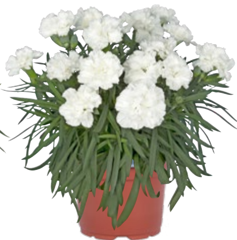
Arabella Angie | 17519