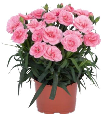
Arabella Peach | 17873