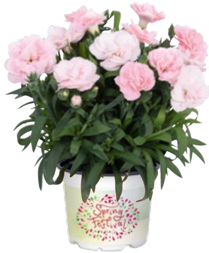
Sprint Pastel | 17784