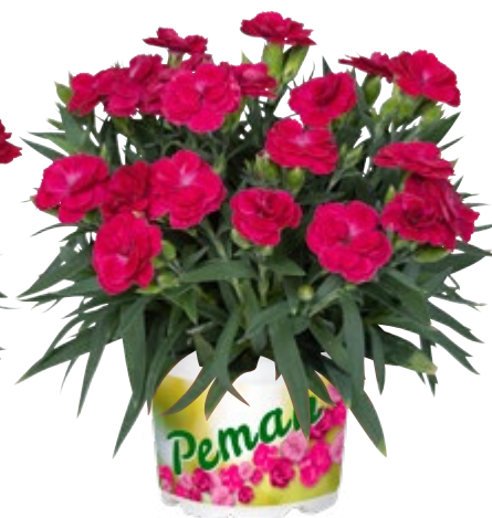
Peman Merlot | 17775