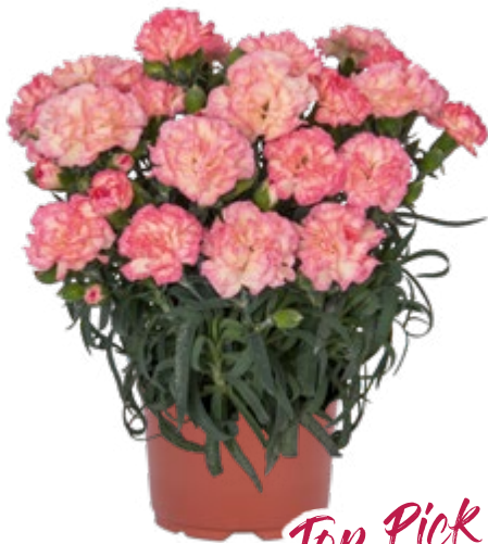
Menorca Floriane | 17572