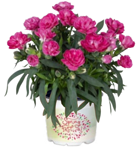
Sprint Dark Pink | 17728