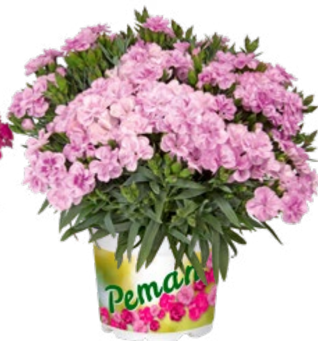
Peman Fancy Lilac | 17547