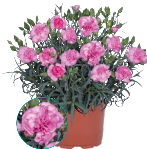
Oriental Soft Pink | 17770