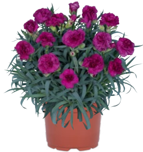
Oriental Musica | 17623