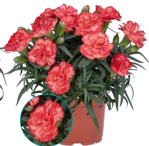
Oriental Abelle | 17611