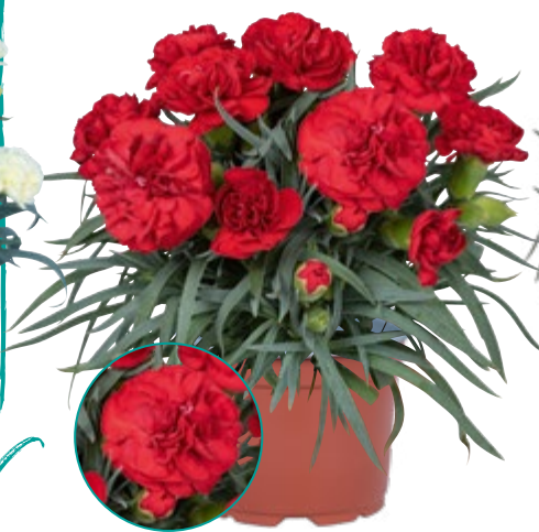
Oriental Paradise | 17760