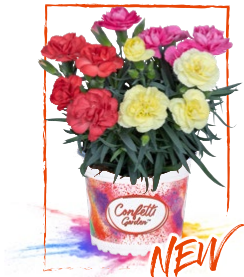
Confetti Garden® Indian | 48545