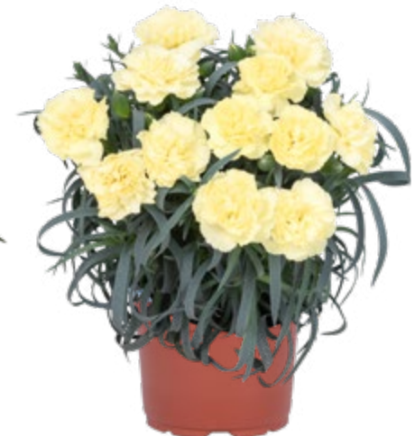
Menorca Yellow 2021 | 17756