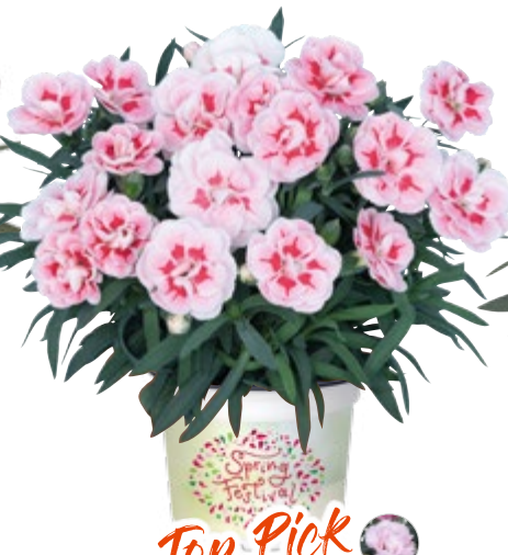
Sprint Fancy Salmon | 17783