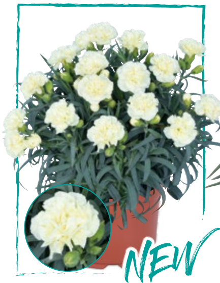
Oriental Lemon Ice | 17916