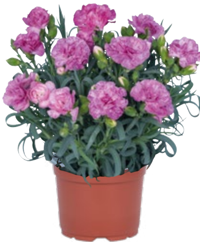
Oriental Soft Pink | 17770