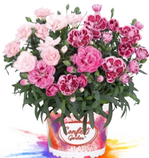
Confetti Garden® Funk | 48569