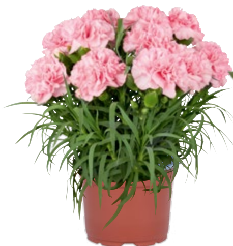
Menorca Pink 2017 | 17561