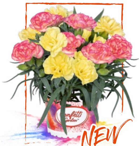
Confetti Garden® Pacific | 48847