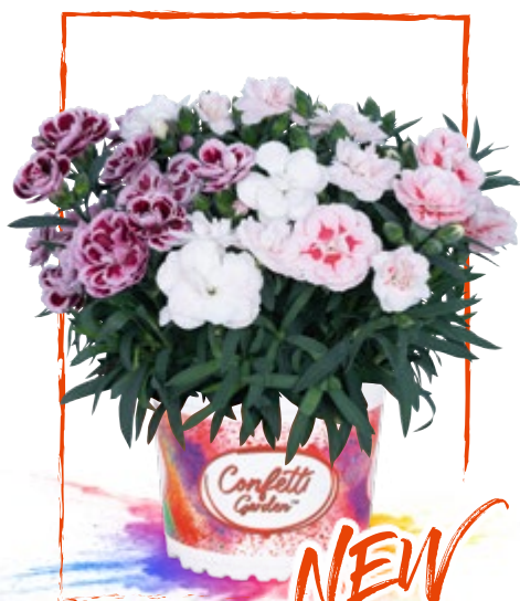
Confetti Garden® Rumba | 49127