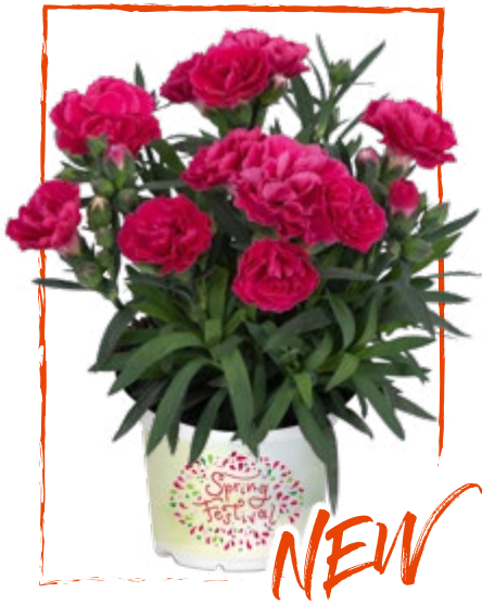
Sprint Cherry | 17932