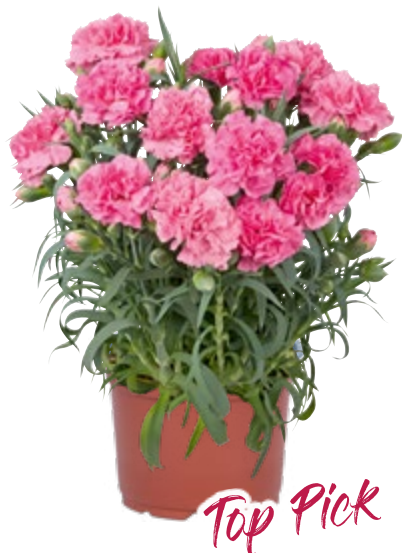
Oriental Camille Pink | 17587