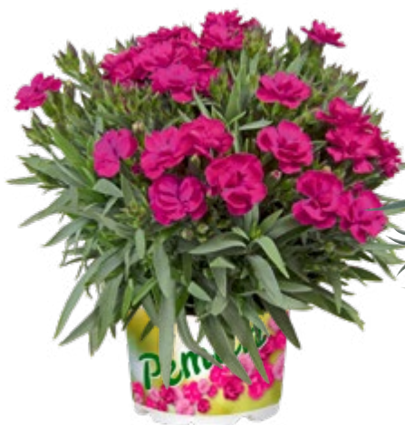
Peman Violet | 17548