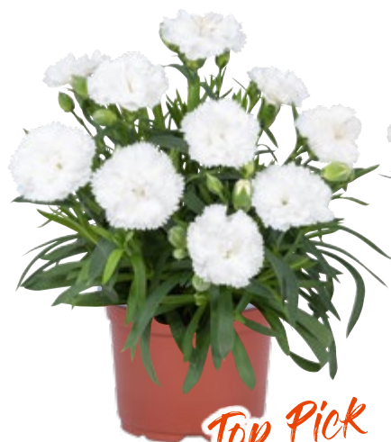
Arabella White | 17732