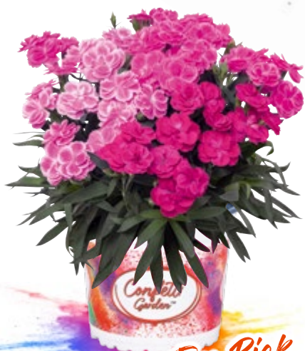
Confetti Garden® Pink Panther | 48300