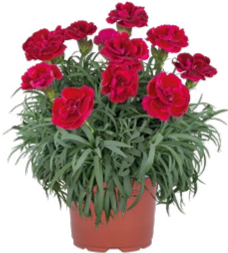
Bacco | 17535