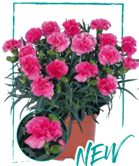
Oriental Pretty Rose | 17958