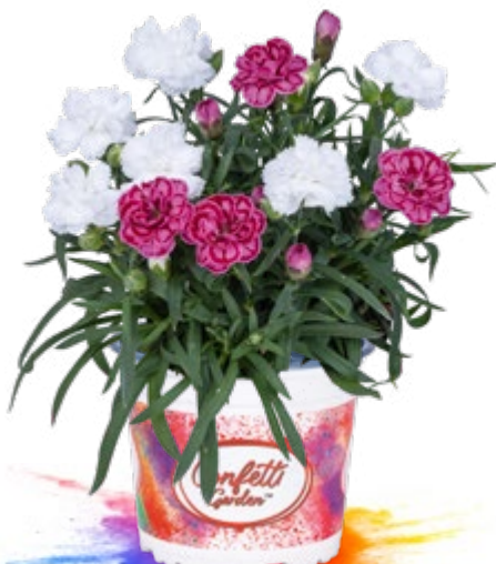
Confetti Garden® Samba | 48573