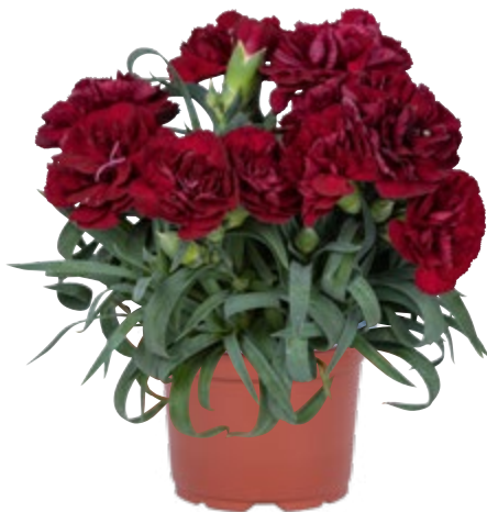
Menorca Dark Red | 17578