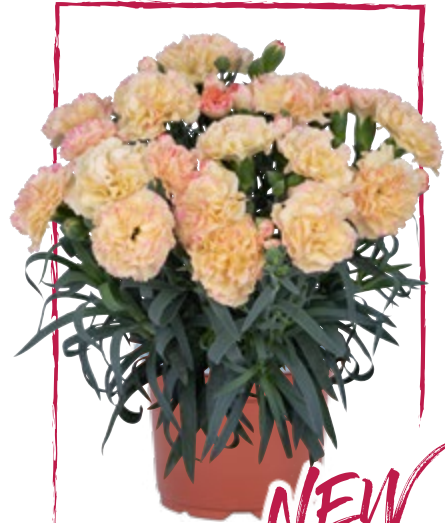
Menorca Floriane Cream | 17904