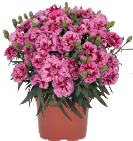
Arabella Pink 2022 | 17785