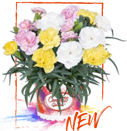
Confetti Garden® Atlantic | 48845