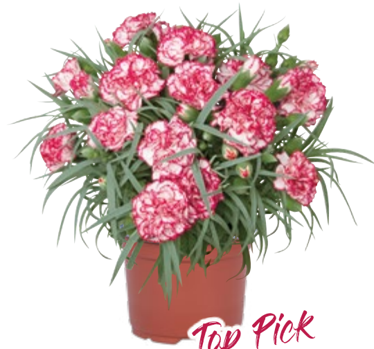
Menorca Hyerres | 17510