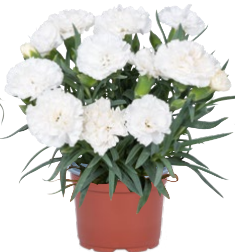
Menorca White 2021 | 17708