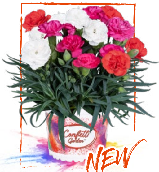
Confetti Garden® Arctic | 48842