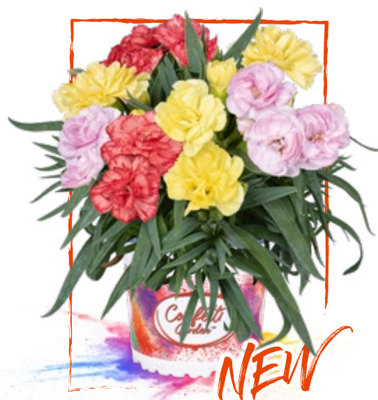
Confetti Garden® Carribean | 48843