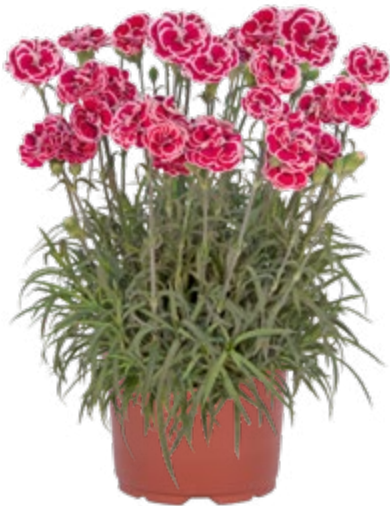
Mondriaan | 17544