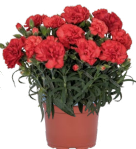
Menorca Orange | 17566