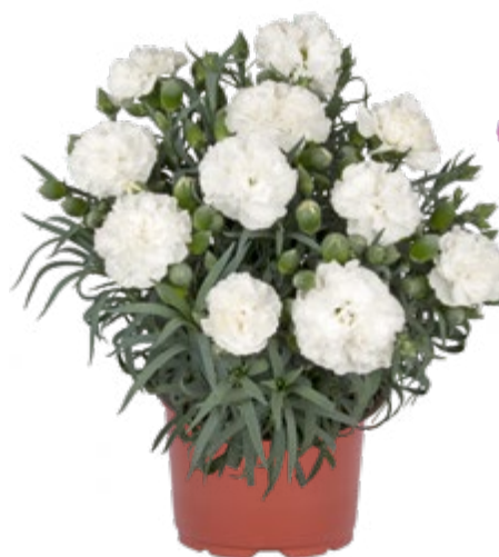
Oriental Durcal | 17585