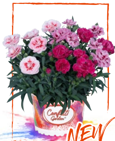
Confetti Garden® Tarantella | 49128