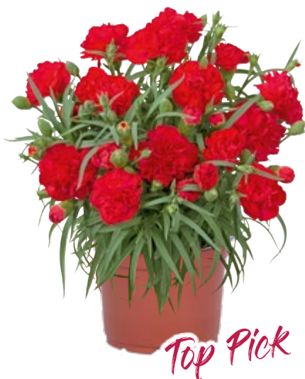
Oriental My Fair Lady | 17579